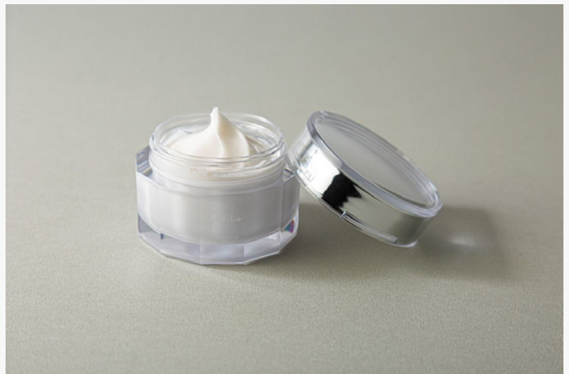
Deaiwo Serum Cream