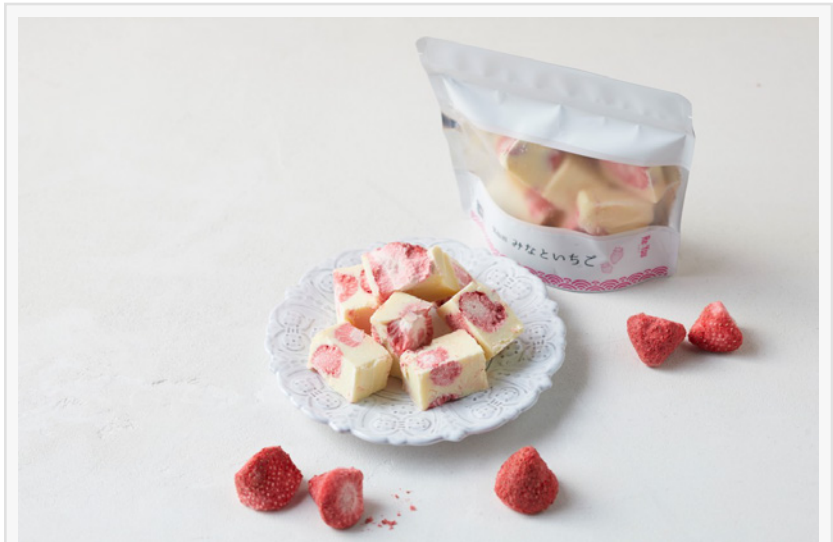
"Re:You" TOHOKU Strawberry Farmers Chocolate

Brooklyn Beauty Fashion Labo is located in Park Slope and carries Japanese food, snacks & beverages, local fashions, rare Japanese imports and beauty items.