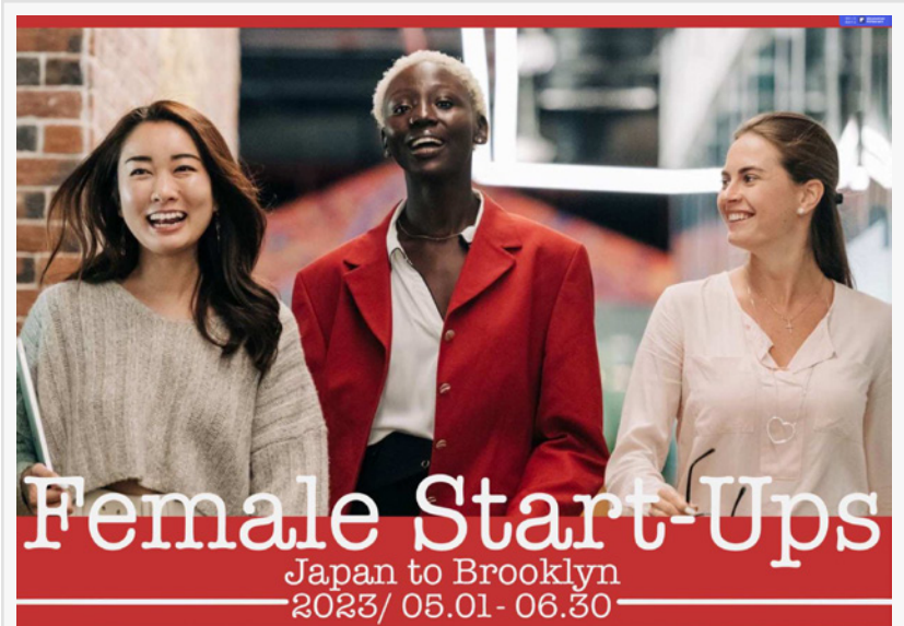
Female Start-Ups -Japan to Brooklyn